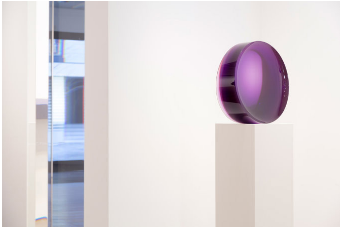
Another view of the show.