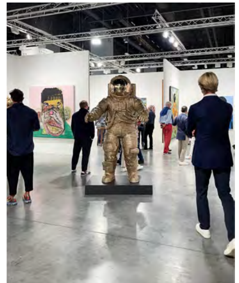
Michael Kagan, Astronaut (2021) with Almine Rech at Art Basel Miami Beach.

Kagan worked with Fatum Arte foundry in Madrid to fabricate the sculptures, which was something of a challenge, given that the capsule needed to be able to float.