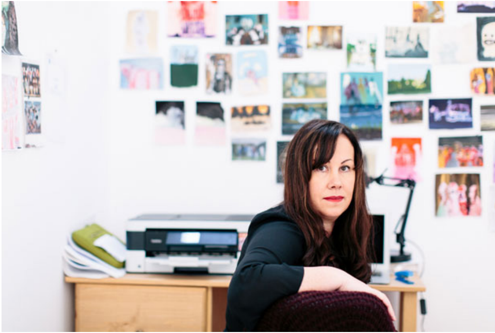
Genieve Figgis

Exploring the creative processes of tomorrow's artists today - as featured in Vitamin P3