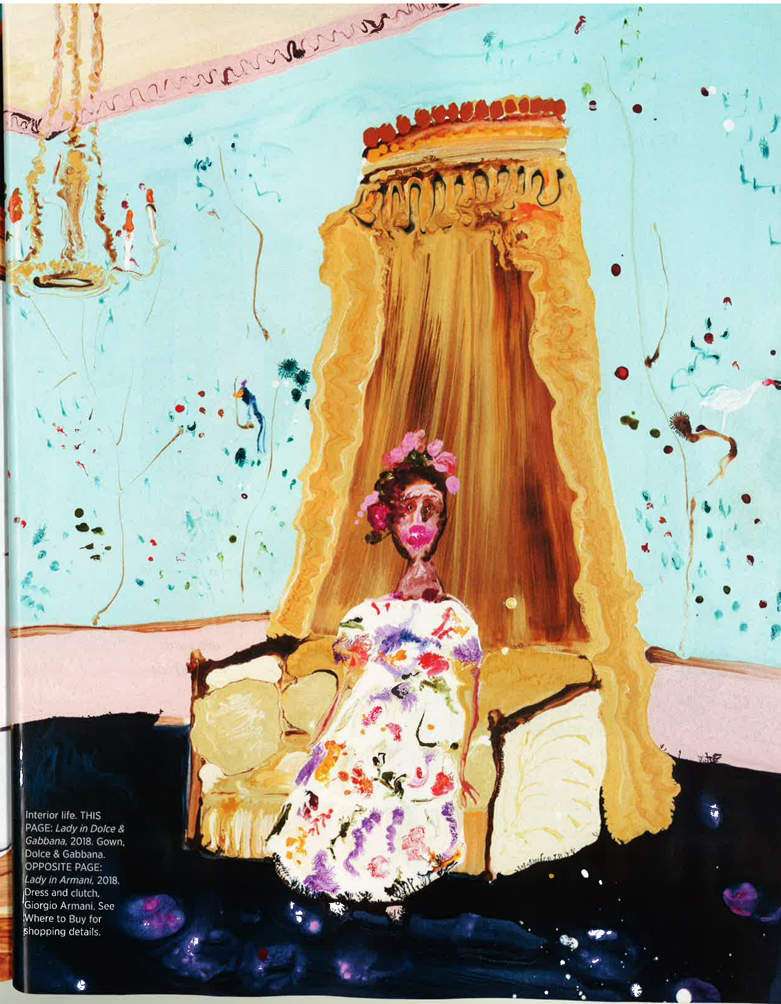
Interior life. THIS PAGE: Lady in Dolce & Gabbana , 2018. Gown, Dolce & Gabbana. OPPOSITE PAGE: Lady in Armani , 2018. Dress and clutch, Giorgio Armani. See Where to Buy for shopping details.