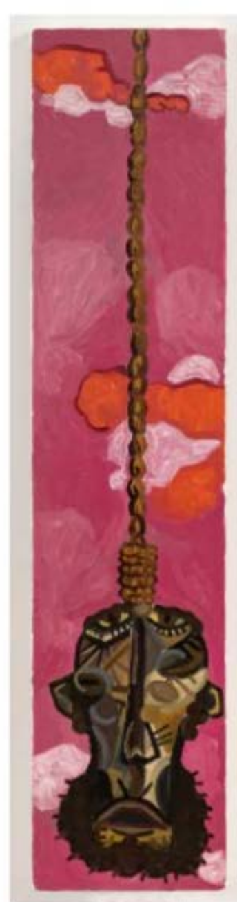
arress from that beging for our $10