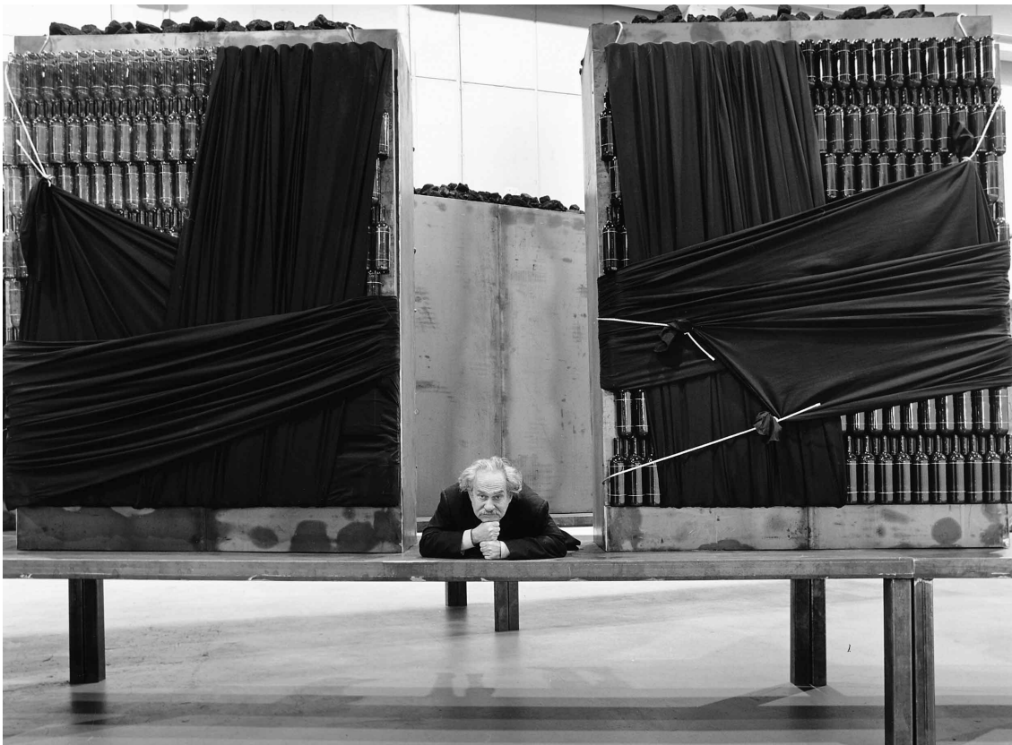
Artist Jannis Kounellis with Untitled, 2010. Ambika P3, London.

Fresh from his solo exhibition at the Parasol Unit Foundation in London (on view until February 17 th , 2012), Jannis Kounellis met with ARTPULSE to discuss his most recent projects and the most significant moments of his outstanding career, from the early days of Arte Povera to his relationship with painting and performance art, and why, after almost 50 years, communication is still the main driving force behind his work.