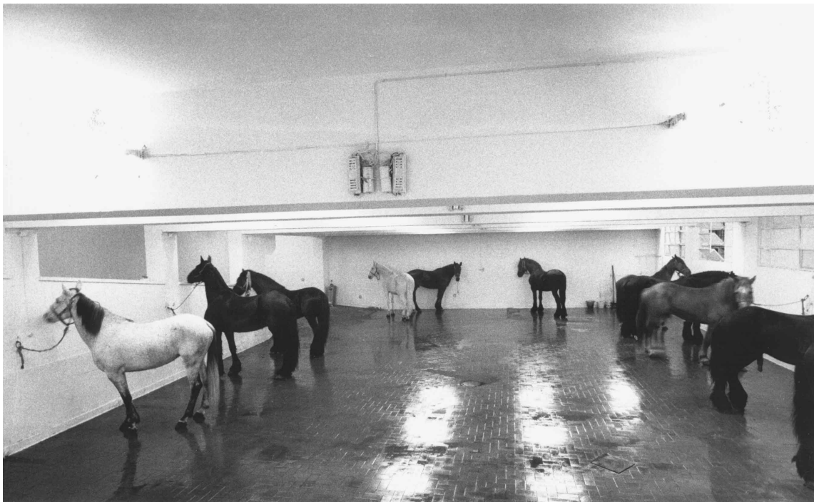
Jannis Kounellis, Untitled, 1969. Galleria L'Attico, Rome.

J.K. - That's true, but it didn't quite work like that for me. Although I have spent 50 years or so in Italy, I wasn't born there. I was born in Greece. I moved to Italy when I was 18. It was a big change, and it gave me a different perspective on what time is about from very early on.