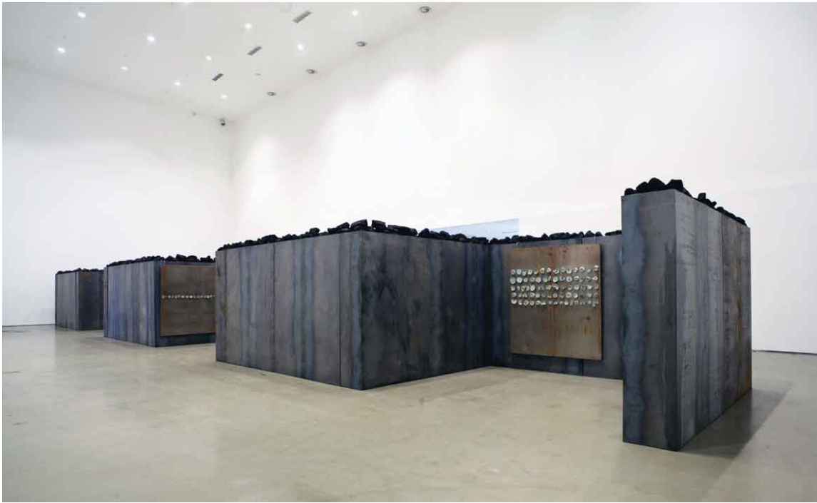
Jannis Kounellis, Untitled, 2011. Today Museum, Beijing.