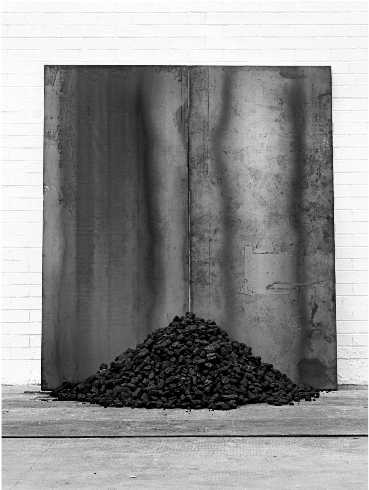
Jannis Kounellis, Untitled, 2012. Tramway, Glasgow.