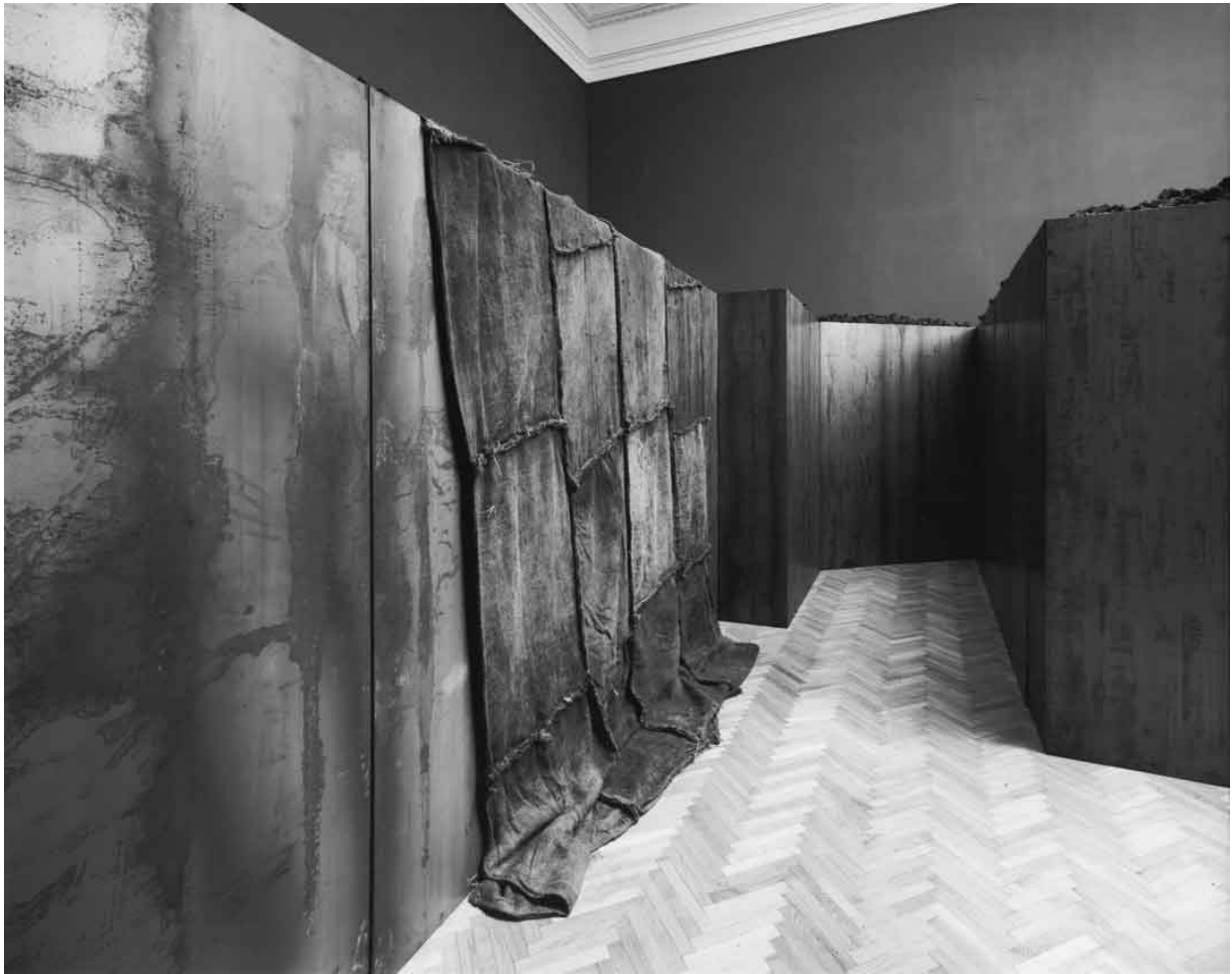
Jannis Kounellis, Untitled, 2002. Galleria Nazionale d' Arte Moderna, Rome.

M.R. - It's interesting that you associate the concept of performance with provocation.