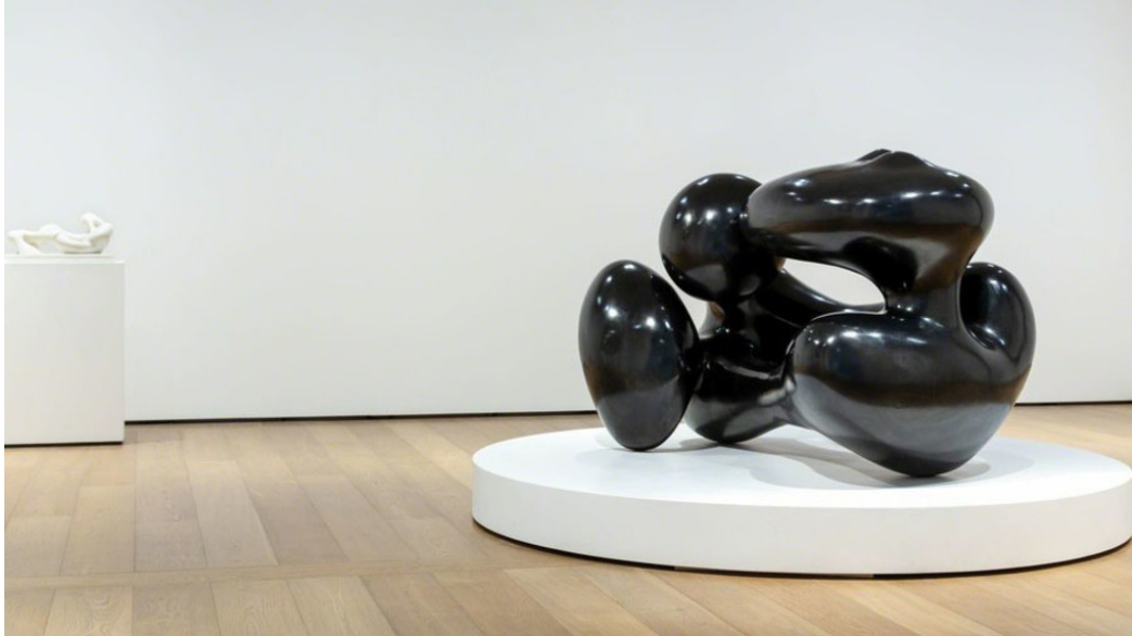
Agustín Cárdenas.

Almine Rech Gallery is pleased to present a solo exhibition of Agustín Cárdenas, opening June 5th, 2018. The exhibition will consist of rarely shown sculpture spanning fifty years of the 20th century master's career, from 1947 to 1997.