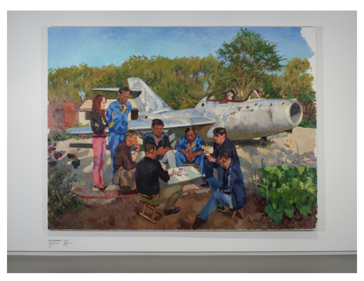
liu Xiaodong, "Jin Cheng Airport"