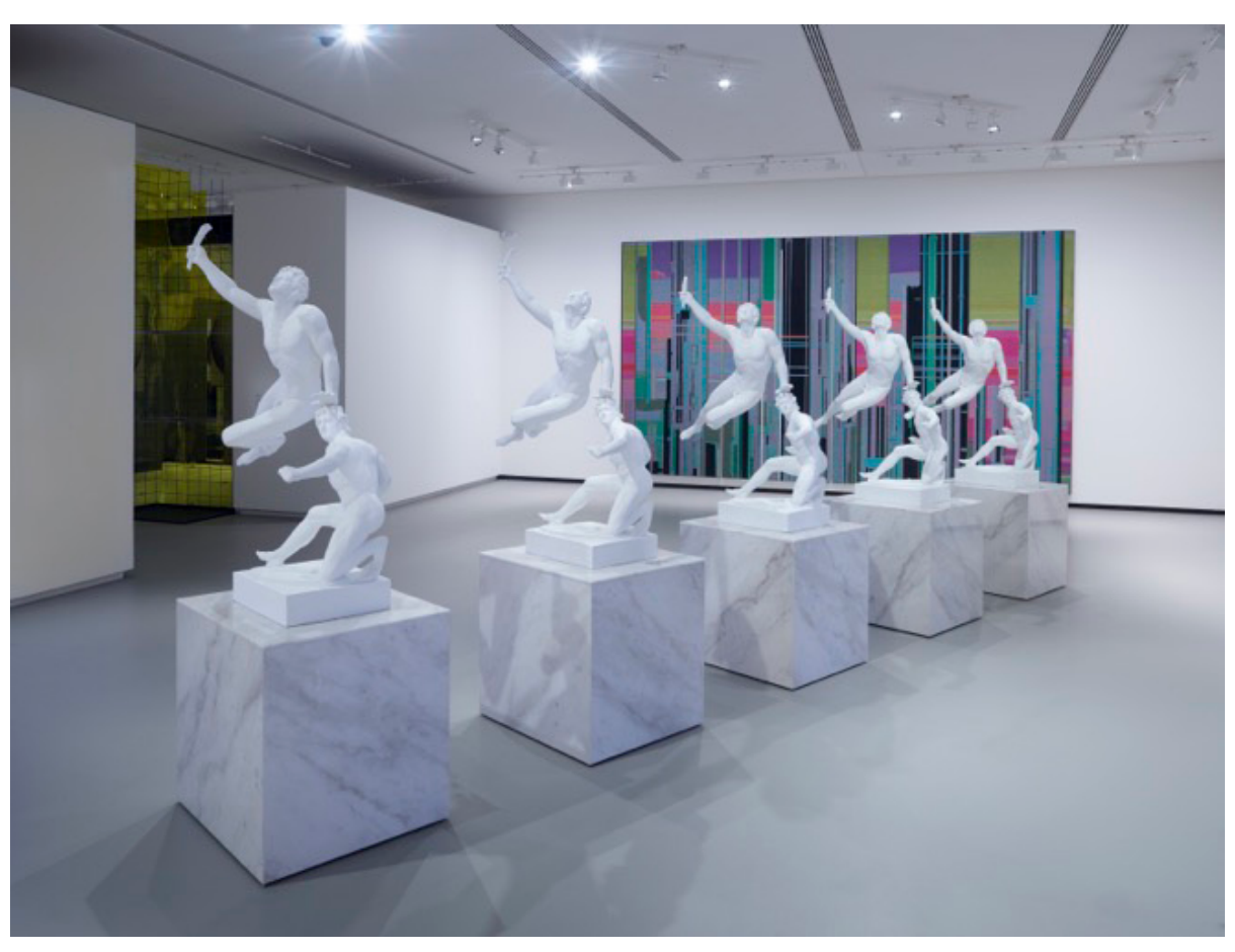
Xu Zhen (Produced by MadeIn Company), "Eternity-The Soldier of Marathon Announcing Victory, a Wounded Galatian", 2014