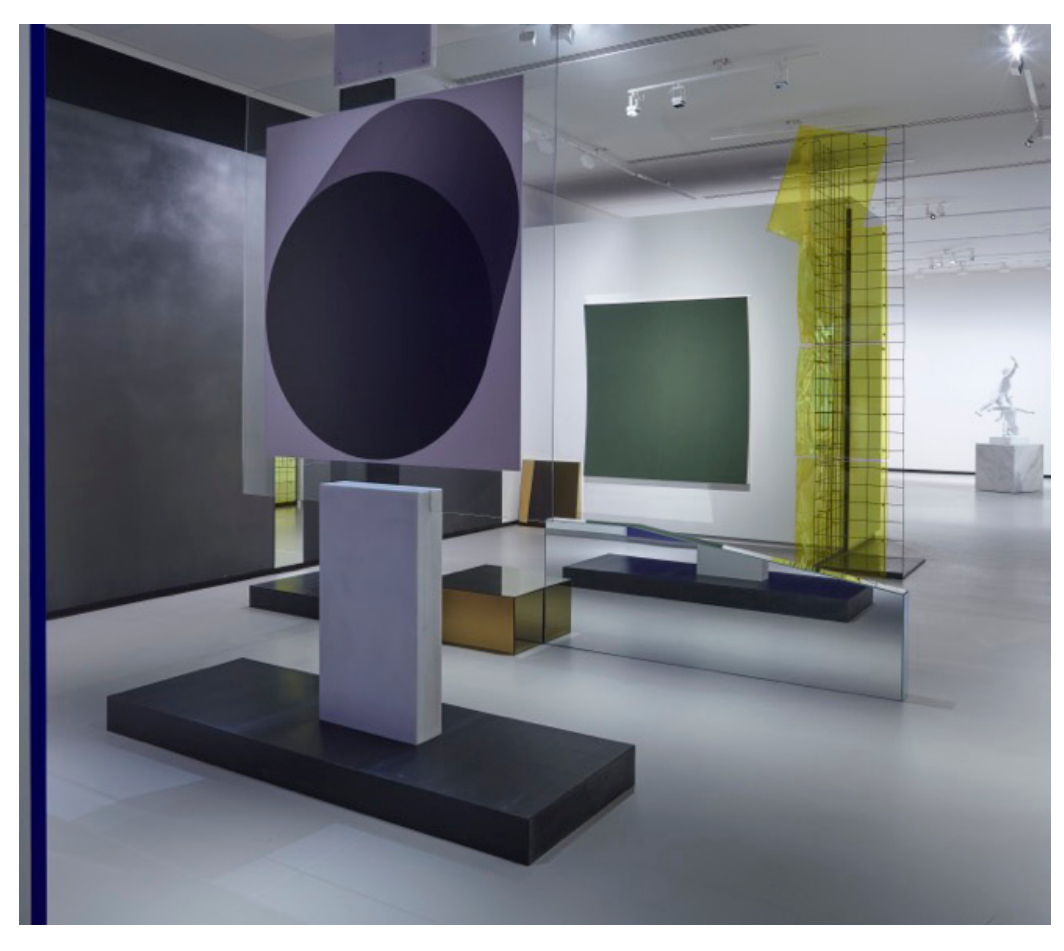
Liu Wei, "Untitled", installation view at Louis Vuitton Foundation, 2015 (©Liu Wei; courtesy of the artist and Louis Vuitton Foundation)