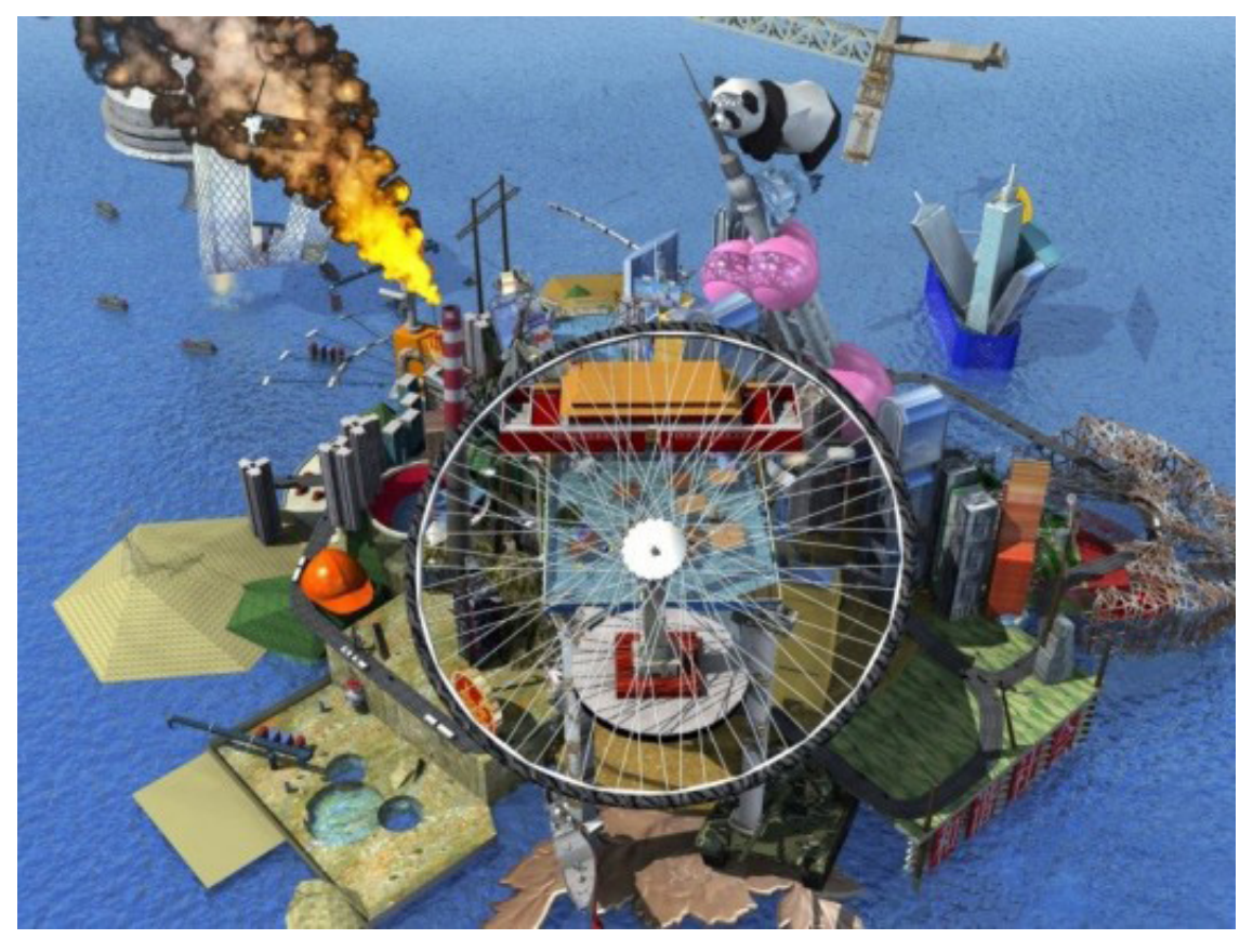
Cao Fei, "Live in RMB City", digital animation still, 2009