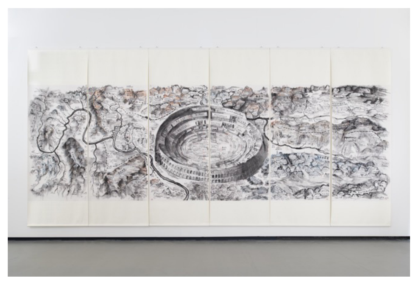
Qiu Zhijie, "From Huaxia to China", 2015