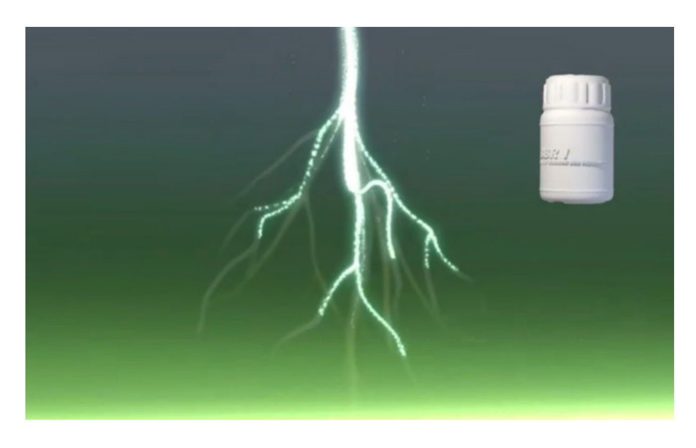
Liu Chuang, "BBR1 (No. 1 of Blossom Bud Restrainer)", video still, 2015