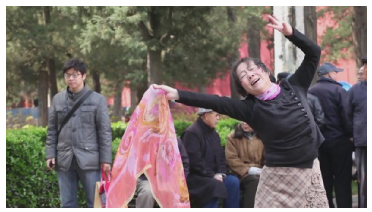
Hu Xiangqian, "The Woman in Front of the Camera", 2015

Many of the works at Fondation Louis Vuitton, centered around themes of pop and contemplation, and raise the issue of dialogue between Eastern and Western artistic heritages. A good example of this (though it is not part of "Bentu") is one of the masterpieces of the collection, the Duchampian bottle rack "Cinquante bras de Bouddha" ("Fifty Arms of Buddha", 1997–2013) that Huang Yong Ping transformed by mounting on it the arms of Buddha statues. "Bentu" offers diffuse knowledge of some of the younger, mid-career artists represented in the collection; this is notably the case with the work of Cao Fei, who exhibited at Le Plateau in Paris in 2008, and Xu Zhen (aka MadeIn), seen at the 2013 Lyon Biennale.