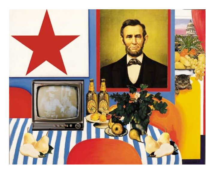
Tom Wesselmann (b. 1931), Still Life #28, executed in March 1963. Acrylic and cardboard collage on board with working television. 48 x 60 in (122 x 151.4 cm). Sold for $798,000 on 13 November 2001 at Christie's in New York.