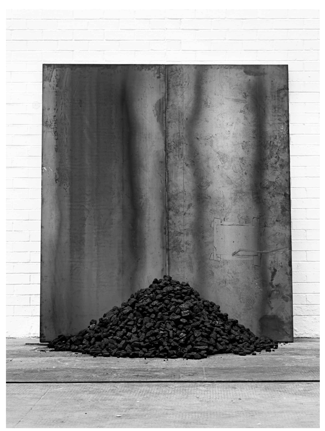
Jannis Kounellis, Untitled, 2012. Tramway, Glasgow.