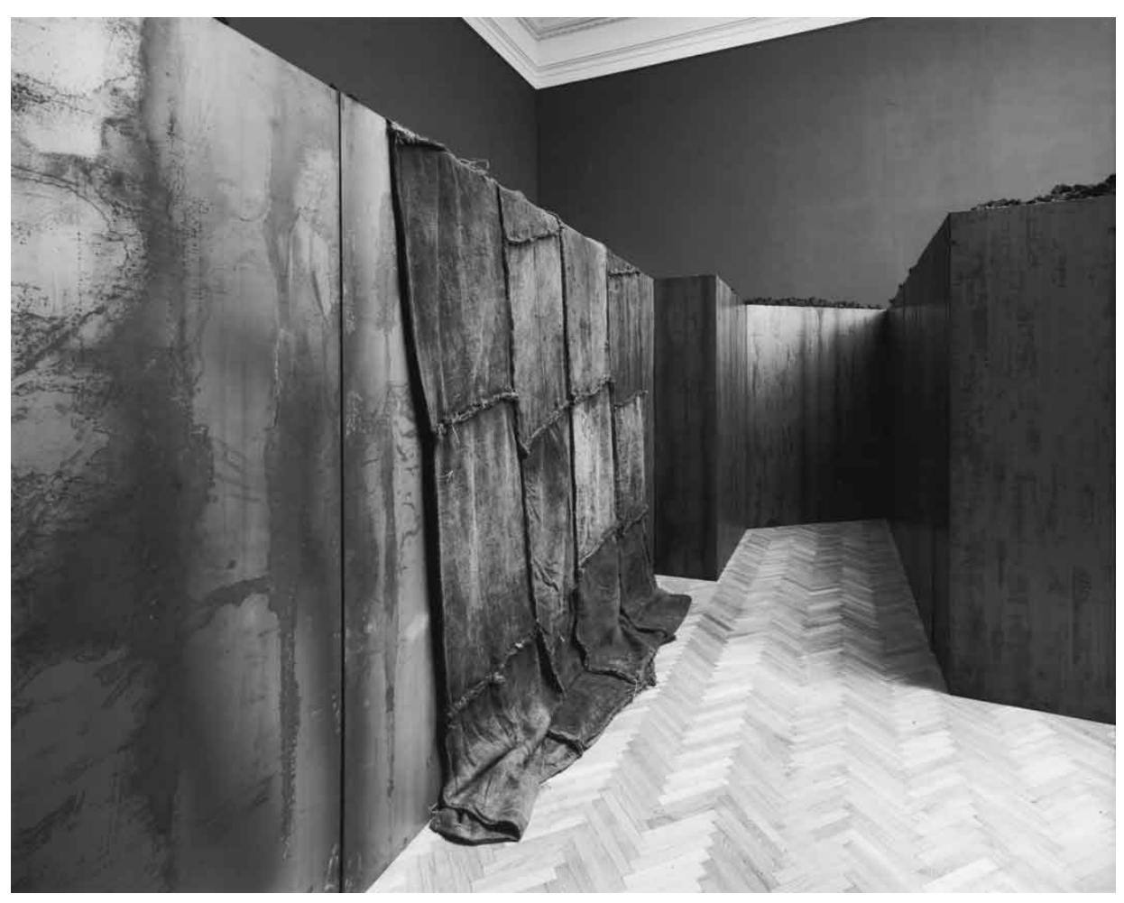
Jannis Kounellis, Untitled, 2002. Galleria Nazionale d' Arte Moderna, Rome.