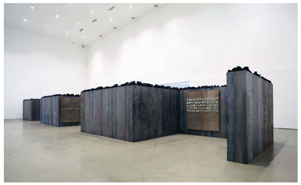
Jannis Kounellis, Untitled, 2011. Today Museum, Beijing.