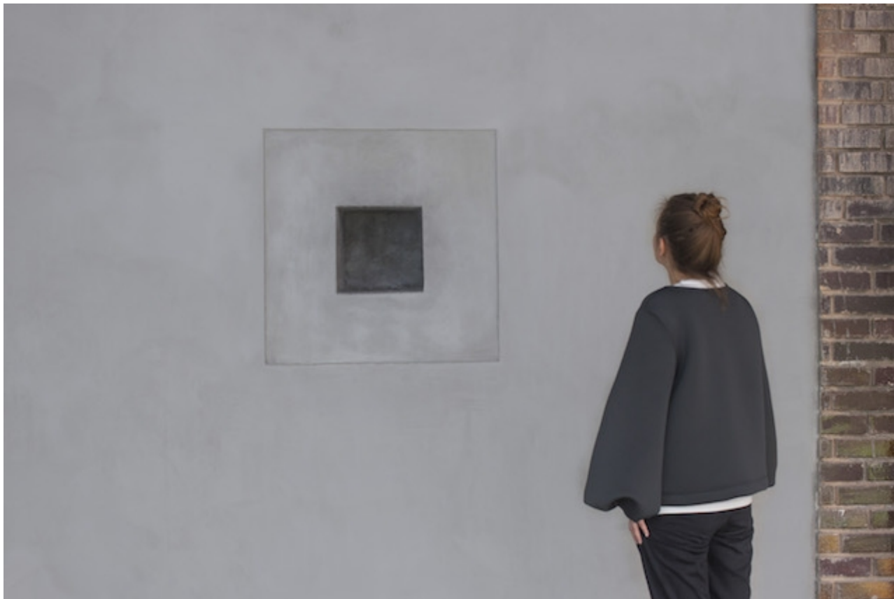
Taryn Simon's Black Square XVII void in the wall at the Garage Museum of Contemporary Art.

In an active nuclear plant somewhere on the outskirts of Moscow, Taryn Simon's latest piece of art is processing out radioactive properties—and will be doing so for the next 1,000 years. Through the vitrification process, Simon worked with the top secret Russian State Atomic Energy Corporation to repurpose nuclear waste to create a compound suitable and safe for disposal. The end result, which will not be unearthed until 3015, will be a glassy black square titled Black Square XVII .