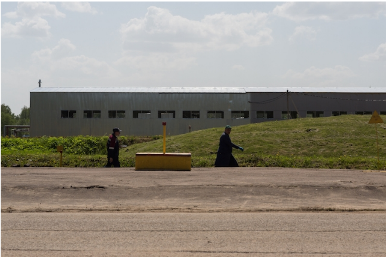
Exterior view of vitrification facility, Federal State Unitary Enterprise Radon, Russia

A portion of the text reads, “ Black Square XVII was created in collaboration with Russia’s State Atomic Energy Corporation (ROSATOM), during the centenary year of the debut exhibition of Kazimir Malevich’s Black Square painting. Simon’s Black Square XVII is composed of medium-level, long-term nuclear waste containing organic liquids, inorganic liquids, slurries, and chemical dusts from a nuclear plant in Kursk, and from pharmaceutical and chemical plants in the greater Moscow region.”