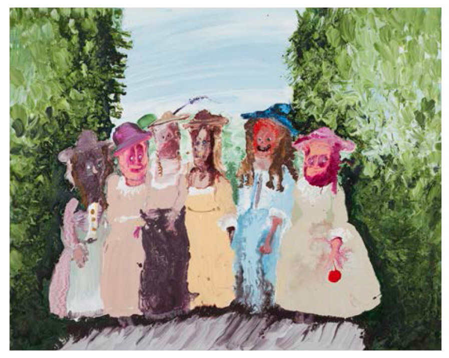
Sunday Ladies, 2016 Acrylic on canvas 39" x 31.5" 2016

Eyes are the windows of the soul. I usually start off on a serious note but somehow the humour comes out in the end.