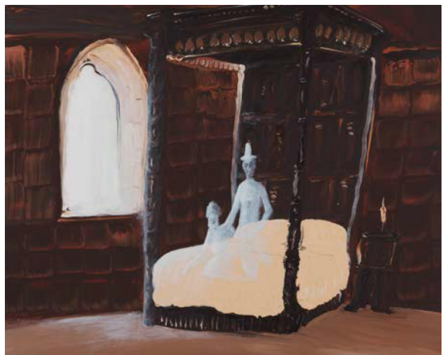
Castle bed Acrylic on panel 20" x 15.75" 2017

Do you enjoy playing God with your fi gures who you love and manipulate? Yes, ha!