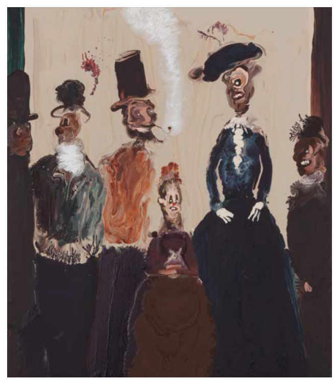
Ensor & Friends Acrylic on canvas 15.75" 20" 2017

"IT MUST FEEL EXACTLY LIKE WHEN PEOPLE SING AT KARAOKE. IN THEIR OWN MINDS, THEY FEEL JUST AS GOOD AND CAN JUST TRY SOMETHING."