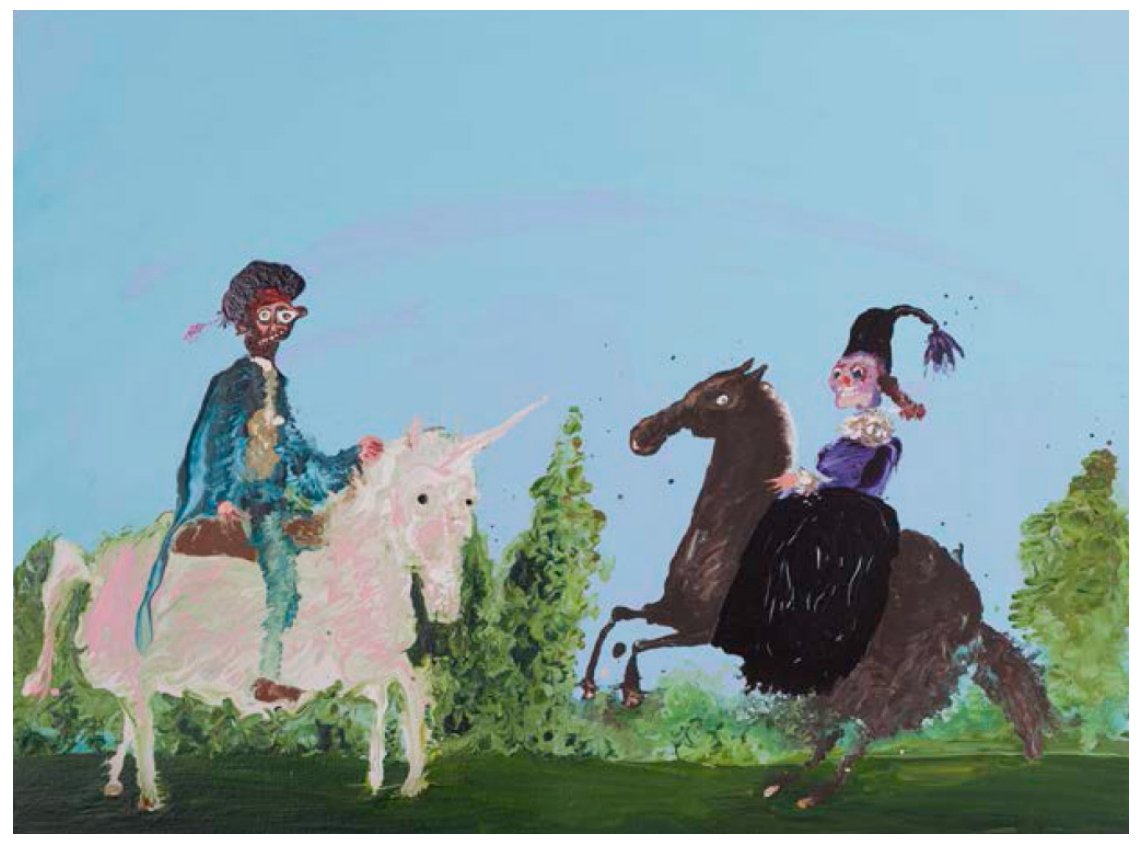
Couple under a rainbow with a pink unicorn Acrylic on canvas 31.5" x 24" 2016