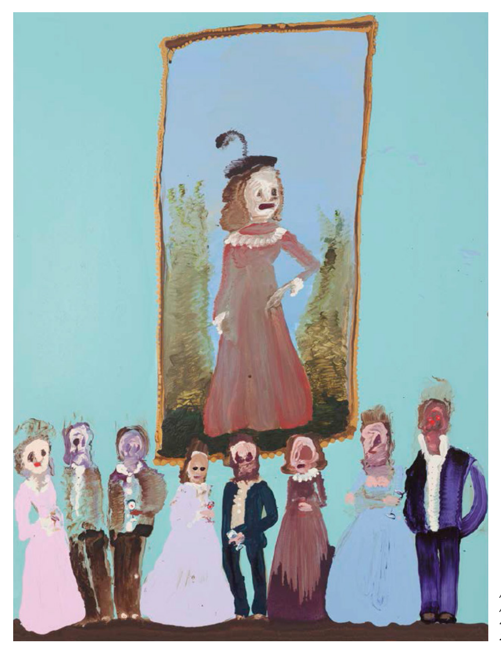
Arty portrait Acrylic on canvas 47.25" x 59" 2017

Her work begins with serious intent, but she acknowledges that humor inevitably pokes through. As artist Ad Reinhardt once proclaimed, "Art is too serious to be taken seriously."