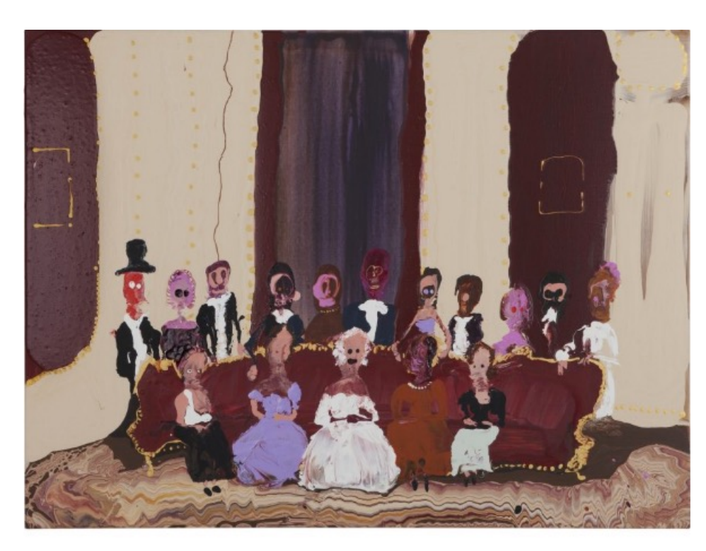
Genieve Figgis, 'Royal friend portrait', 2017 Acrylic on canvas 162,6 x 121,9 cm, 64 x 48 in. Genieve Figgis 'What we do in the shadows' at Almine Rech Gallery, Brussels

GF: I never set out to portray grotesque or comedic in my work. This is something that happens in the process. When you look at the paintings hopefully you will see that nothing has been planned or contrived in any way. Everything happens by chance.