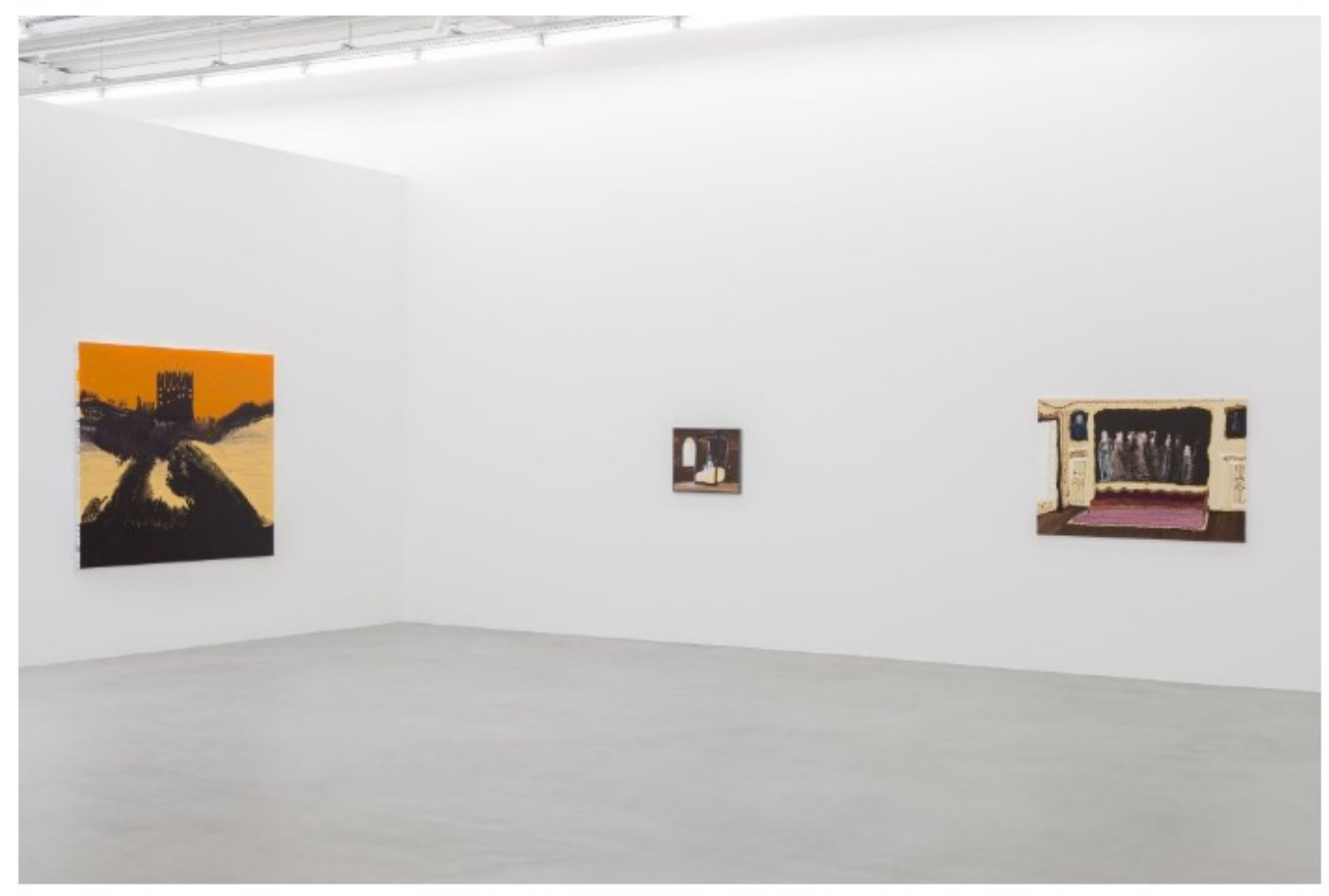
Genieve Figgis 'What we do in the shadows' at Almine Rech Gallery, Brussels

GF: Yes. When I was growing up I attended drama classes. Putting on plays and making costumes was a big part of my life.