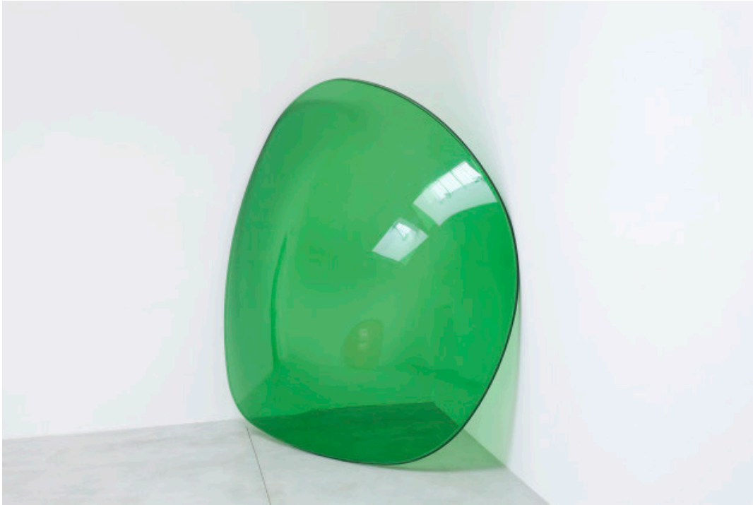
Lens (Jade), 2013.