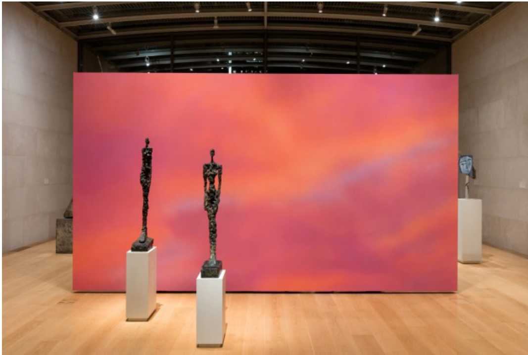
Sky Backdrop, 2015, behind two sculptures by Alberto Giacometti, at the Nasher Sculpture Center, Dallas, 2015.