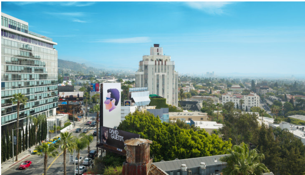
A billboard of Self Portrait, 2013, on L.A.'s Sunset Strip