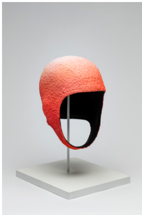
Israel's Cap, 2015.