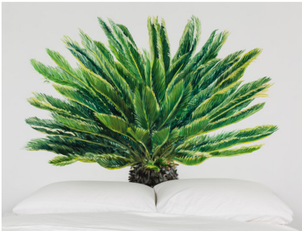
A detail of Movie Star Maps, a room-size mural commissioned by Jeffrey Deitch for his L.A. home.