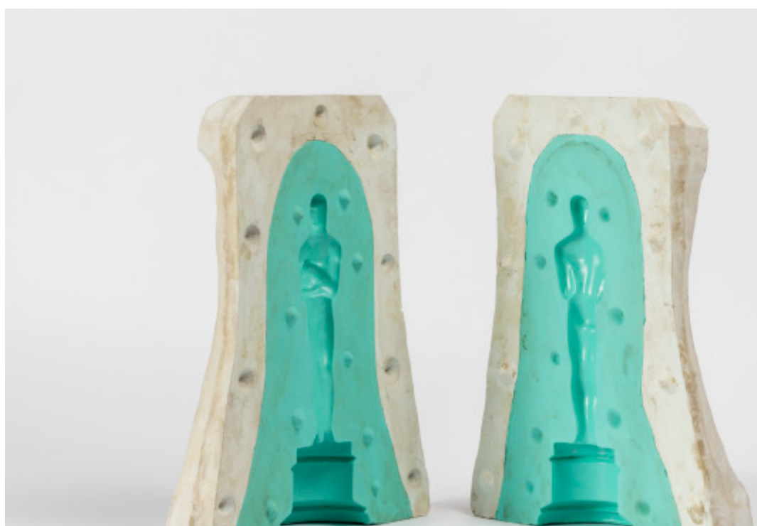
Casting, a 2015 sculpture inspired by the mold from which Oscar statuettes are made.