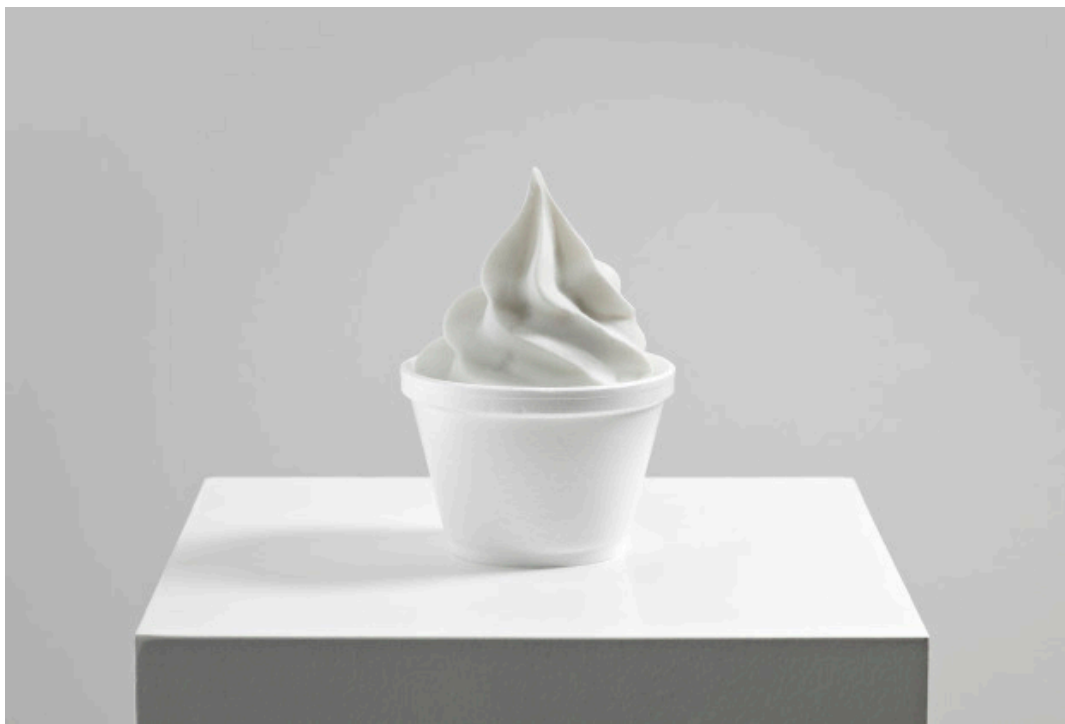
The Bigg Chill, a 2012 work in which a frozen yogurt swirl is rendered in marble.