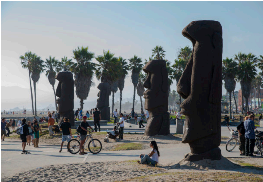
.Easter Island, a series of totems erected for the 2012 Venice Beach Biennial.