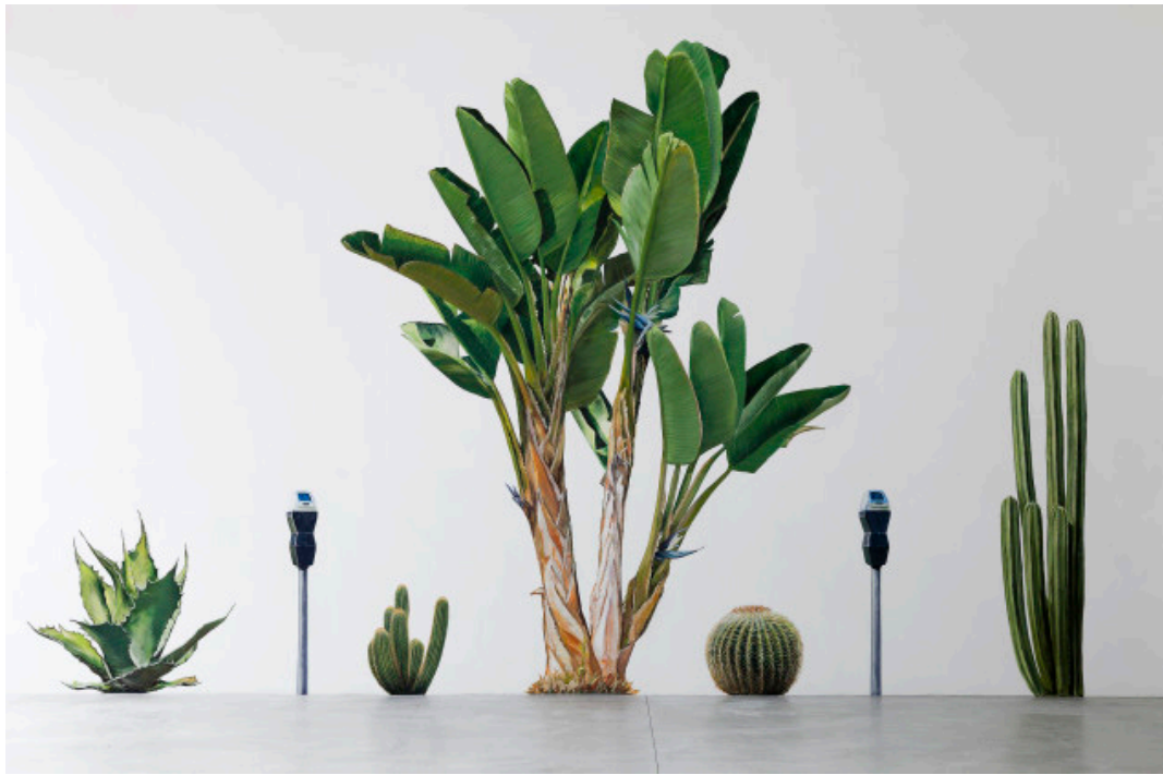
Valet Parking, 2013, a mural installed for the solo exhibition "Alex Israel" at Le Consortium, Dijon, France, 2013.