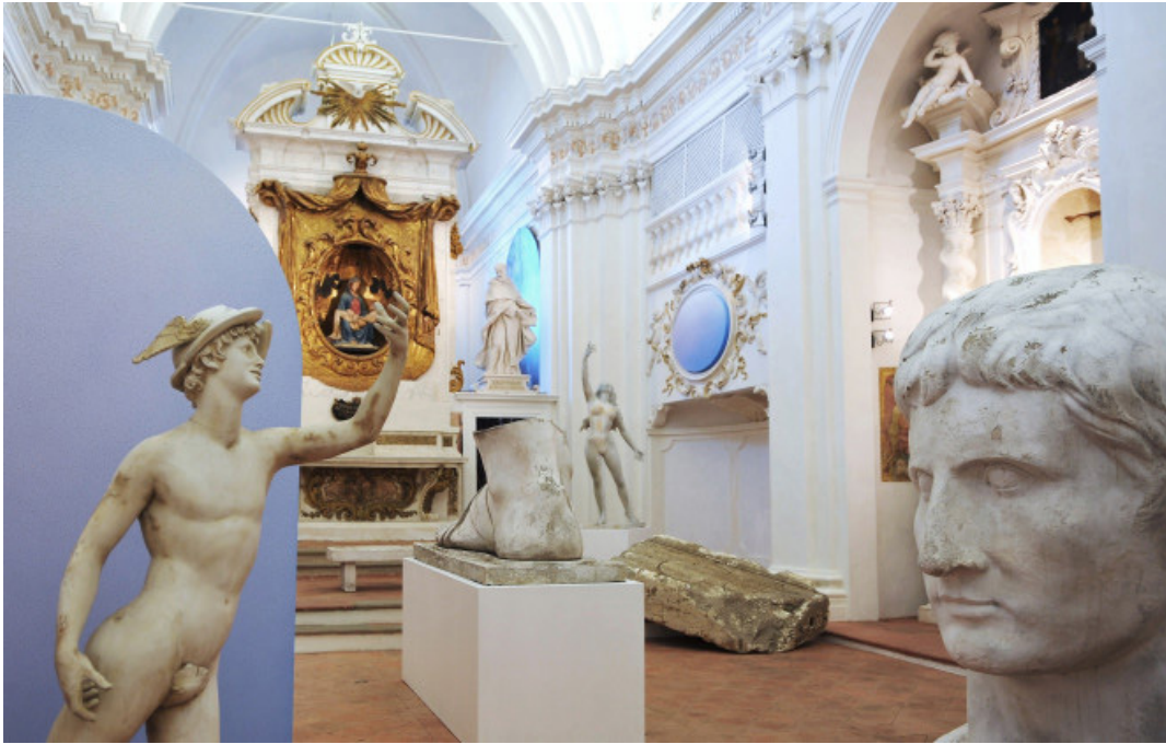
Installation view of "Alex Israel," an exhibition at Museo Civico Diocesano di Santa Maria dei Servi, Città della Pieve, Italy, 2012.