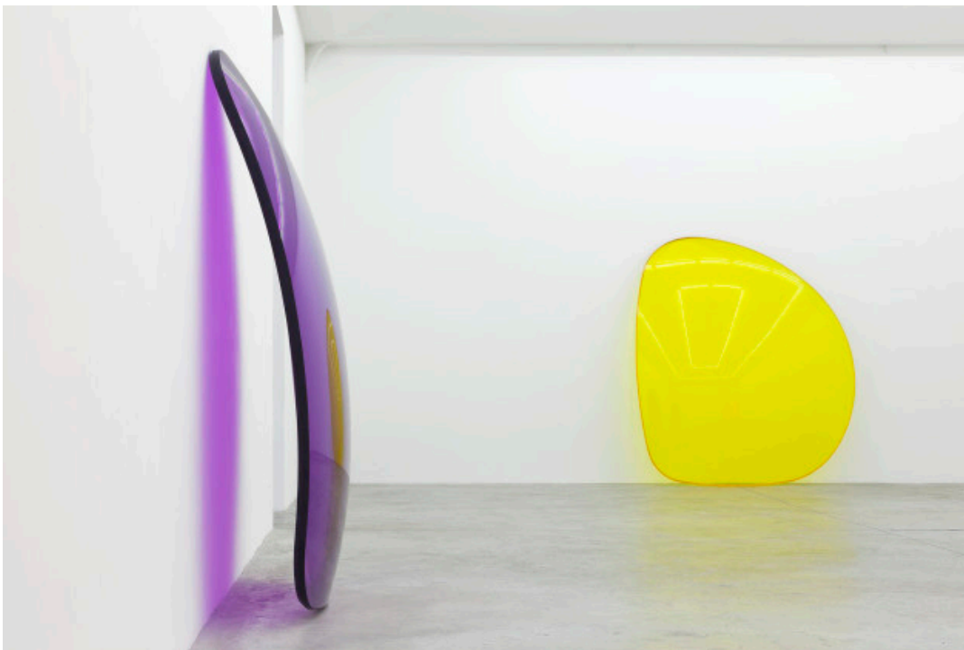
View of the exhibition SUMMER, 2015.