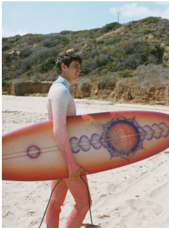
Noah Centineo. Courtesy of Rachel Chandler.