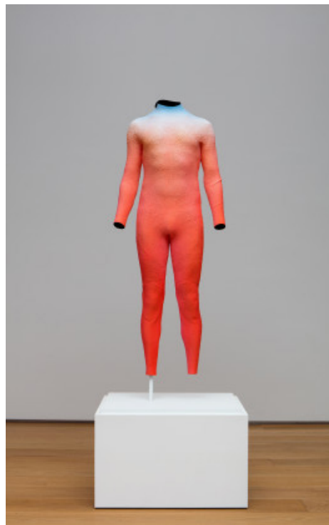
Self Portrait (Wetsuit), 2015.

Joshua White/Courtesy of the artist and Gagosian Gallery.