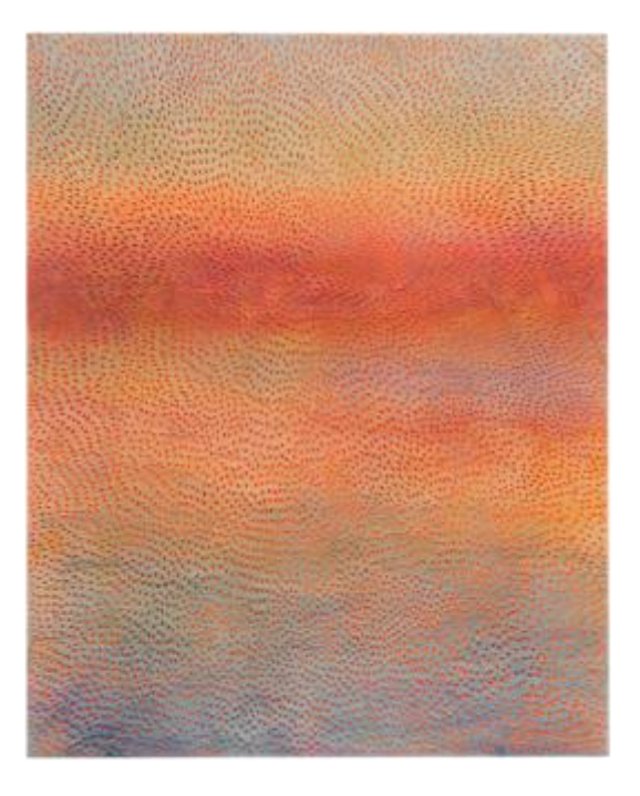
Photo: Courtesy of Jennifer Guidi A 92" H. X 74" W. work with sunset allusions