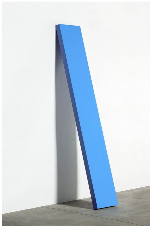
John McCracken, Link, 2000, Polyester resin, fiber glass and wood, 231 x 38 x 6,5 cm, Courtesy of the Artist's Estate and Almine Rech Gallery