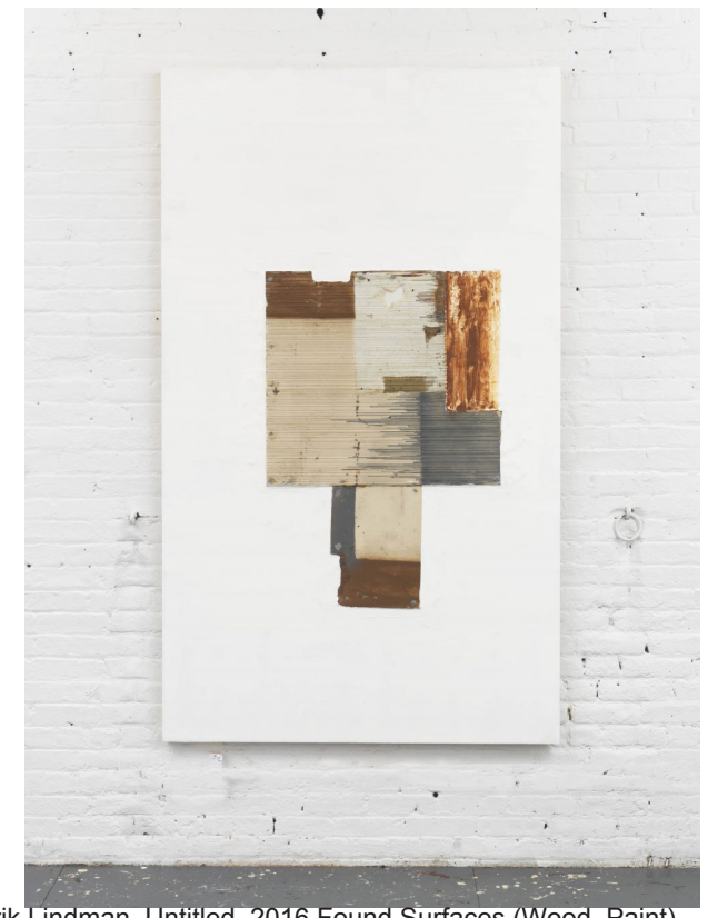
Erik Lindman, Untitled, 2016 Found Surfaces (Wood, Paint) Oil and Acrylic on Panel 198,12x116,84 cm 78x46 inches