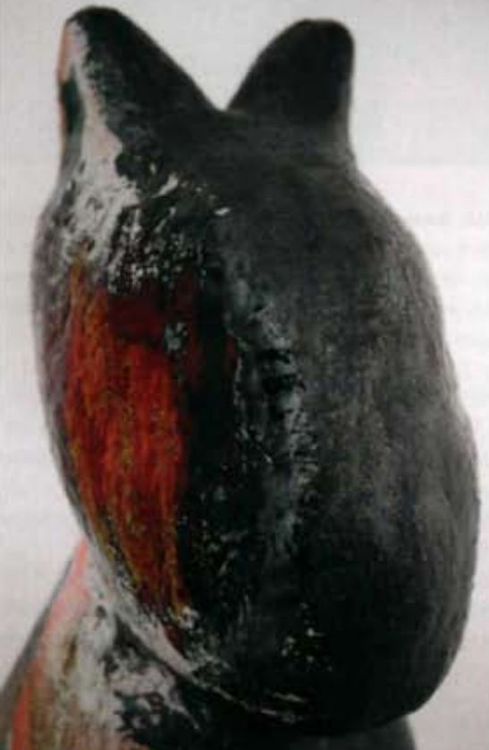
Above and detail: The Collectors, 2008–09. Glazed stoneware, 3 elements, 200 x 60 x 85\,\mathrm{cm} , each.

techniques. When it came to the torso covered with roses, foundries in the U.S., Germany, and France said that my work was far too complex to cast. I finally found a foundry close to Oudenaarde, near Ghent, where they could do this type of work. There is a lot of trompe-l'oeil in this exhibition. You don't really know which pieces are clay and which are bronze. The ambiguity is funvisitors repeatedly mistake one for the other.