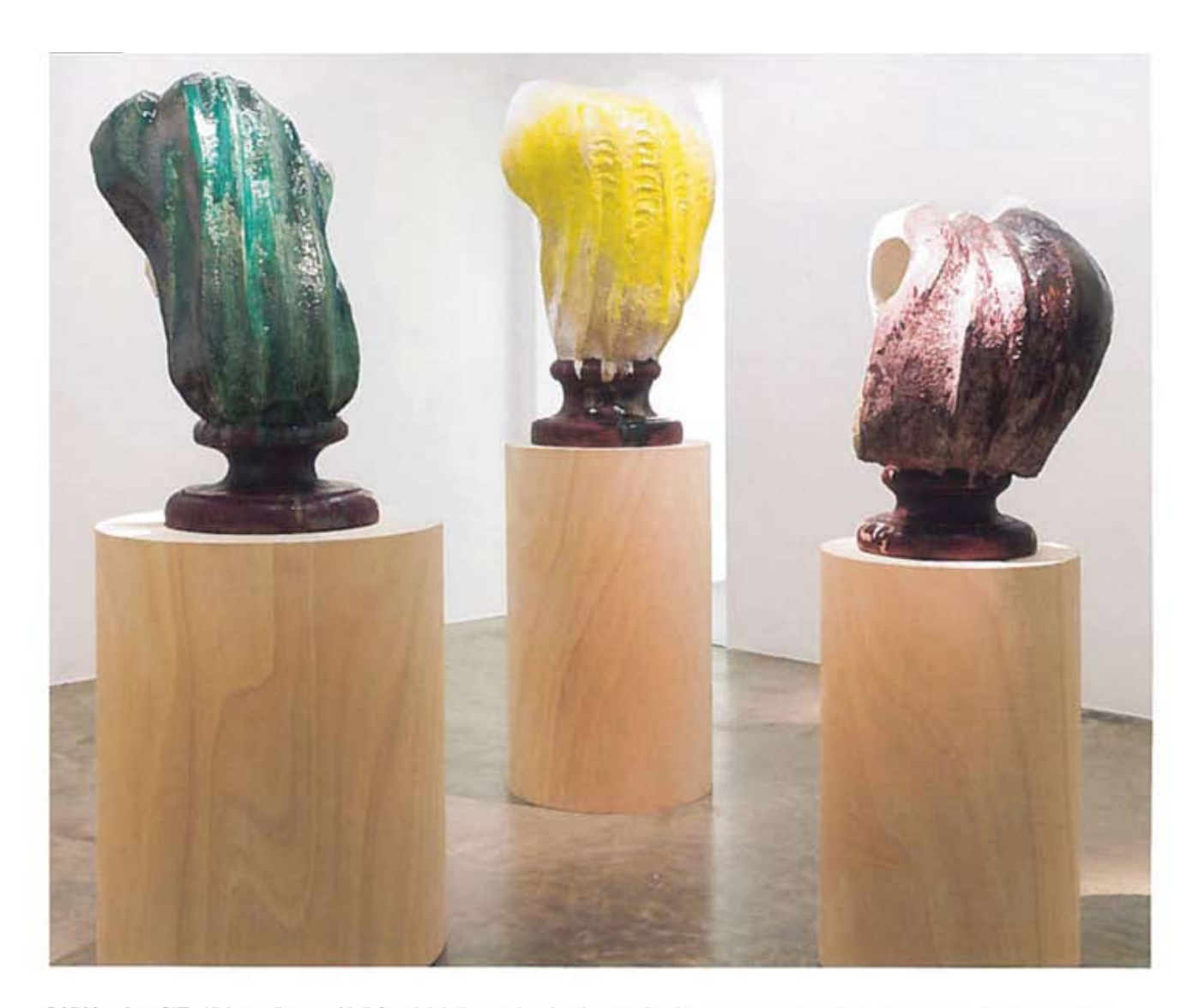
Exhibition view of "The Vivisector," 2013, with (left to right): Fortuna Grande—G, 2012, glazed stoneware, 130 x 75 x 65 cm.; Fortuna Grande—M, 2012, glazed stoneware, 110 x 70 x 65 cm.; and Fortuna Grande—P, 2012, glazed stoneware, 85 x 60 x 60 cm.

could survive outside of the white box. All of the art I liked was shown inside white cubes. My test is that the work should be able to stand on its own at the flea market. It has to be able to tell the whole story from the inside, and not as a result of being placed in a gallery.