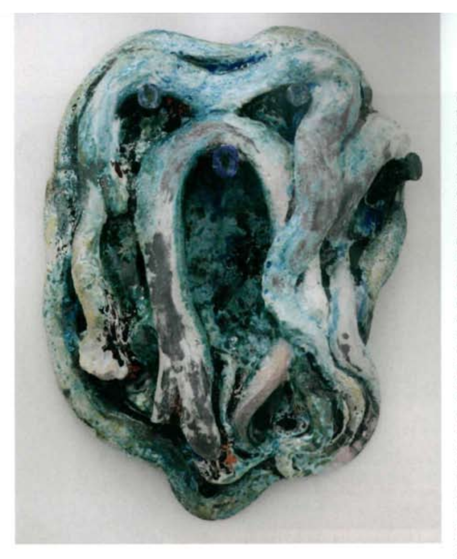
A Dutch Garden, 2009. Glazed stoneware, 81 x 65 x 20 cm.