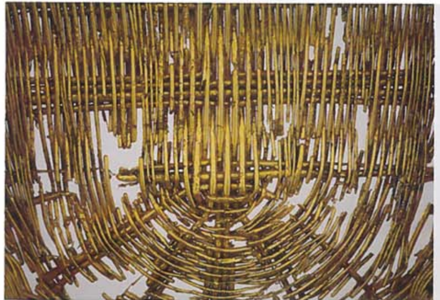
Right and detail: The Cradle (De Bakermat), 2009-10. Bronze, 245 x 70 x 90 cm.

Take this mushroom shape ( Génie , 2009–10), which is much more concrete than a Surrealist image. The form resembles a mooring bollard to which boats are fastened. We call these bittes d'amarrage in French—a term that works on different levels. [ Bite , pronounced the same way, is "cock" in French, and mooring oneself to one would amount to a colorful way of referring to a wide variety of sexual acts.] The form also refers to fake mushrooms found in the popular garden, which references back to the earth, the male sex, the male force, the strength of the earth, so these shapes are very straightforward and direct, and here, they are linked to a flowery shape, which is the opposite. One is solid and dark and defined, while the other is in movement and changing. The title could mean artistic inspiration or the "genie trapped in a bottle"—you rub the sculpture to make your dreams, your passions, come true.