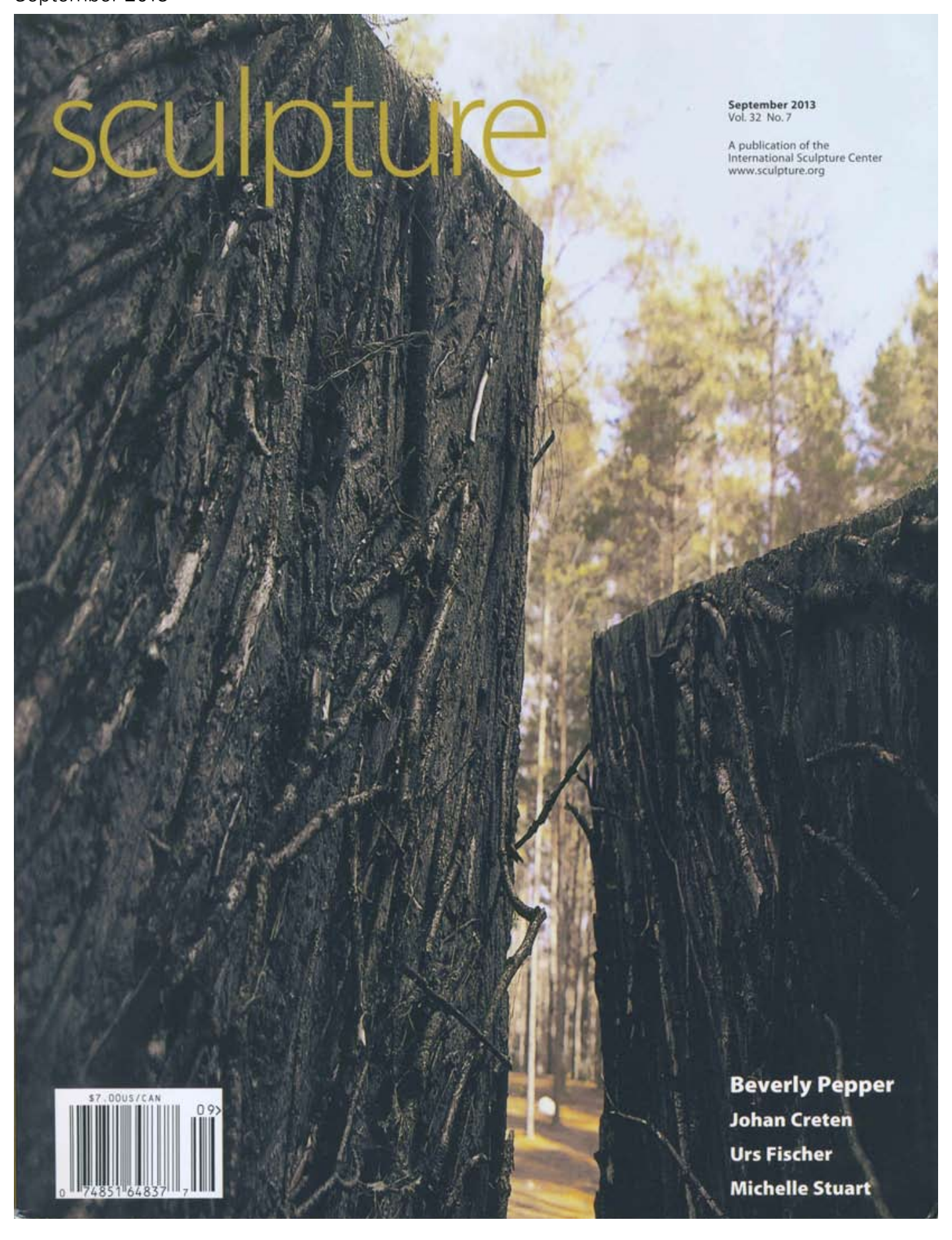
<u>Sculpture</u>: 'Concentred Forms, A conversation with Johan Creten', by Michaël Amy, September 2013