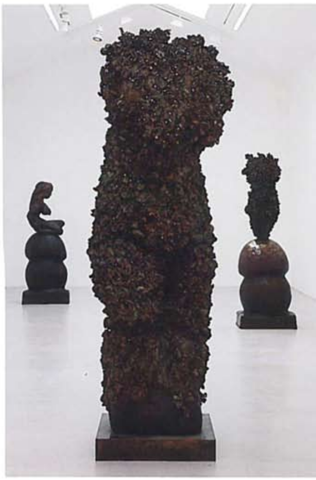
Left: The Rock (detail), 2009–10. Right: Exhibition view of "Dark Continent," 2010, with (left to right): I am a Good Horse on a Soft Brick, 2004–08, bronze, 187 x 64 x 48 cm.; The Rock, 2009–10, bronze and gold, 263 x 72 x 72 cm.; and Génie, 2009–10, bronze, 212 x 69 x 48 cm.

its own history. You have places that have been polished, and then you find places with the same rich bluish-green of bronze that has been exposed to the elements over many years.