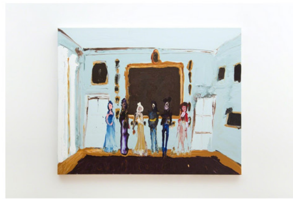
Genieve Figgis Royal Group, 2015 Almine Rech