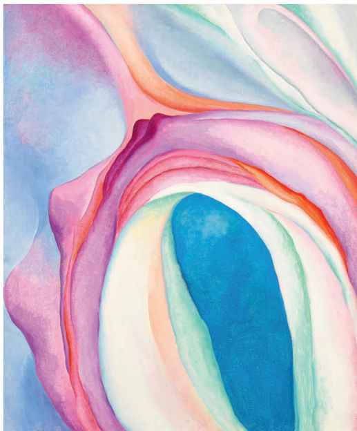
Georgia O'Keeffe's Music, Pink and Blue No. 2, 1918

"Renzo Piano's latest masterpiece, the Whitney Museum's new home in Manhattan's Meatpacking District, will open on May 1 with what will be the largest exhibition of the museum's extensive permanent collection of 20th and 21st century American artists. The inaugural show, "America Is Hard to See," explores the ideologies and practices of 400 American artists over the past 150 years."